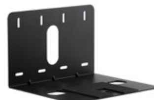
VC-AC03 Wall Mount

Lumens TM Brilliance by Design www.MyLumens.com